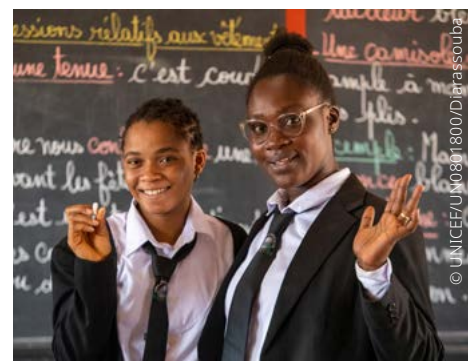
Madjara 19 & Elodie 34, teachers in training